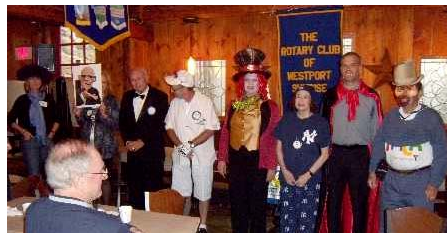
Creative costumes were on display