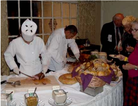
One of the carving stations was a popular stop