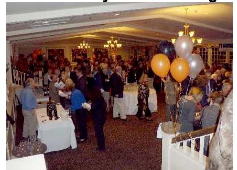
Some of the 400+ attendees at the October 29 th Winetasting & Silent Auction WSR fundraiser at Longshore Inn