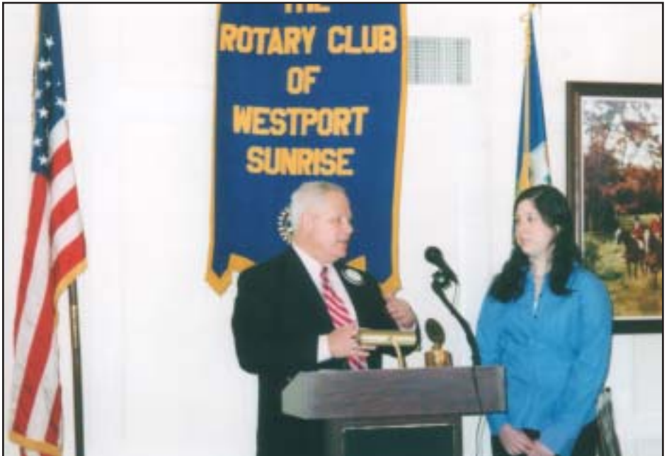
Student of the Month

Having A Terrific Time Making A Small Difference